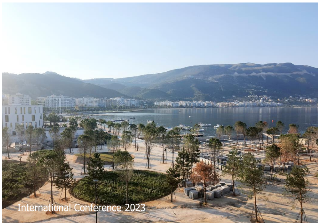
International Conference 2023

Best Regards, International Conference 2023 SRC4ph